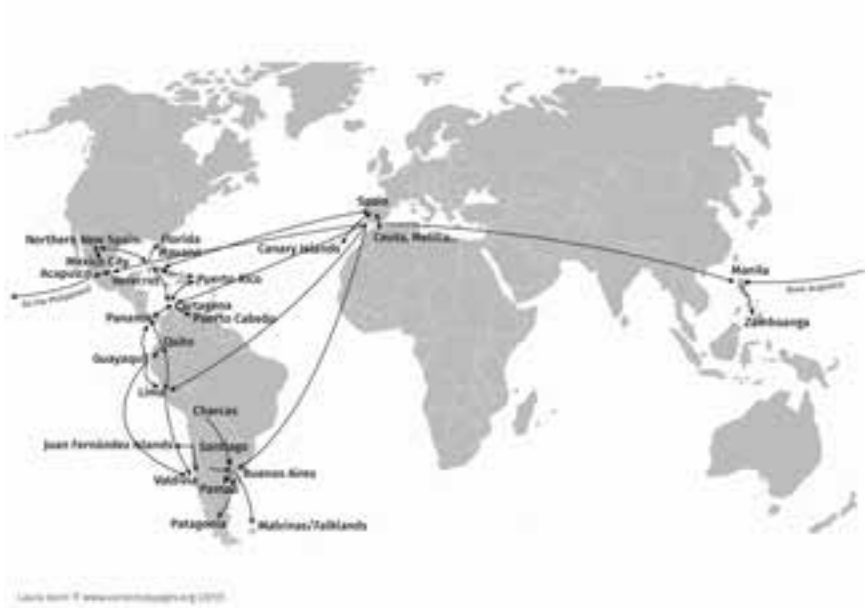
Map 3.1 Penal transportation to the presidios , 1760s–1800: overview